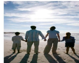
A Guide for Spouses' in Leadership Roles